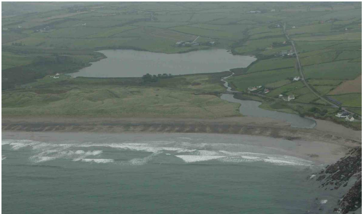
Plate 1: Aerial photo of Kilkeran Lake

The lake has suffered from eutrophication in the past, and the once thriving trout fishery on the lake has now gone (NPWS 2000). Lagoons are significant as they are becoming increasingly rare in Ireland and Europe and Kilkeran Lake is the best example of a sedimentary lagoon in south-west Ireland.